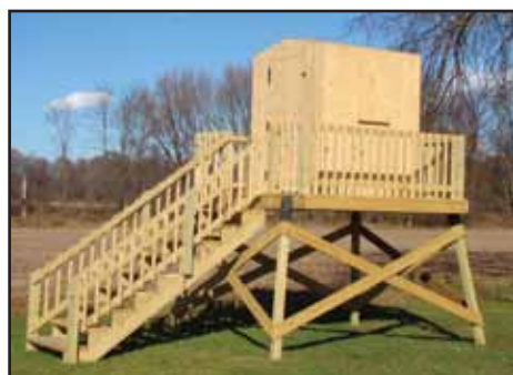
4x4 (E188) Double 8 Elevators, set of 4.